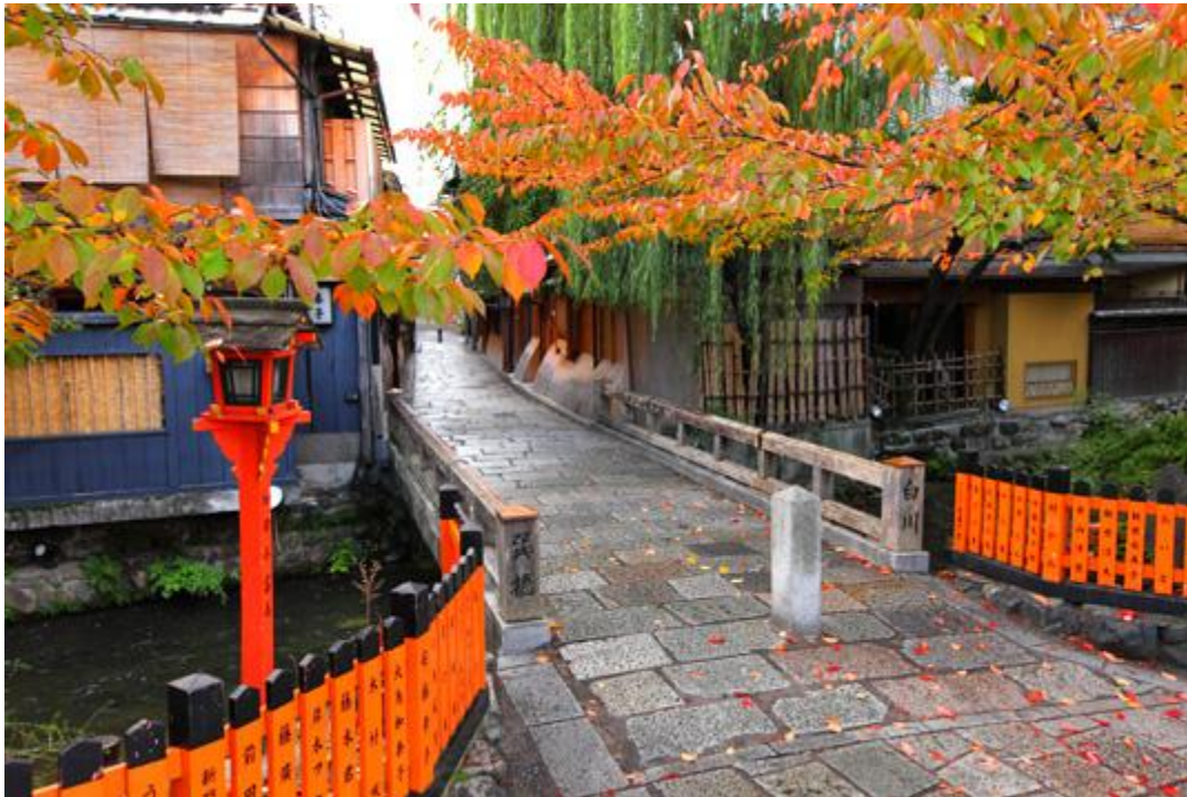
Gion: old Kyoto's district